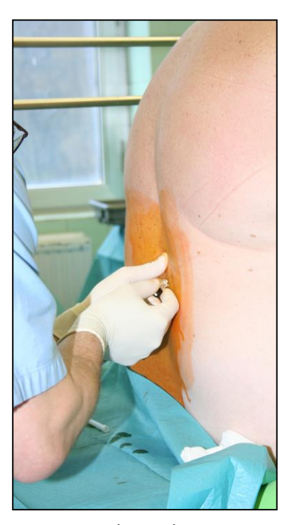
Fig. 1: Spinal anesthesia

Nerve block: a nerve block is an anesthetic or anti-inflammatory injection targeted toward a certain nerve or group of nerves to block pain. It may be given into the arm, the leg or the neck onto or near a nerve for the temporary relief of pain.