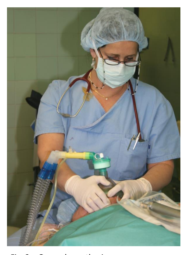
Fig. 3: General anesthesia

Intubation makes oxygenation easier and prevents aspiration of the stomach contents. Relaxants may also be administered to help intubation and oxygenation, ameliorate the circumstances under which the surgical exposure is performed and reduce the amount of anesthetic used.